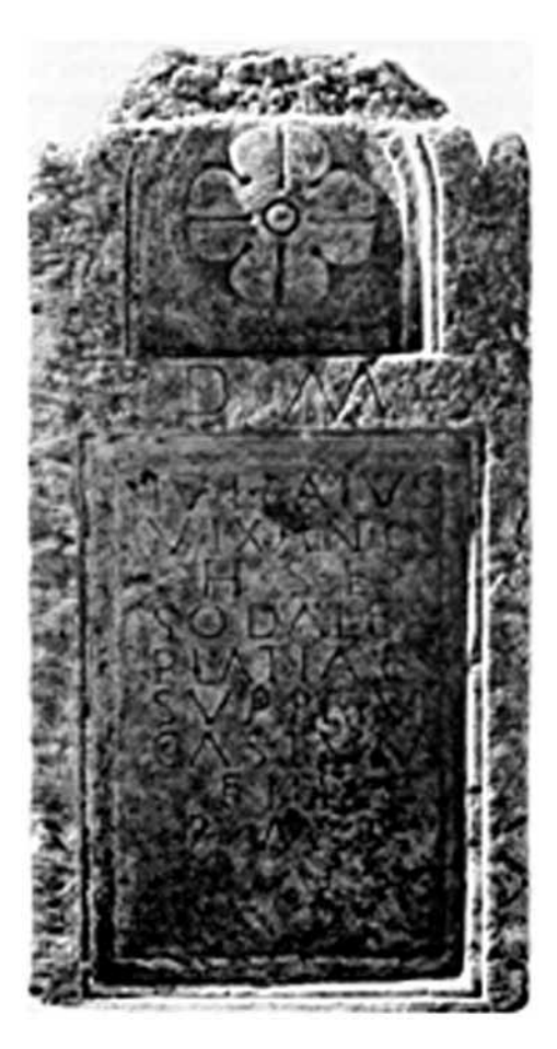
Stalae No. 7 Lopate