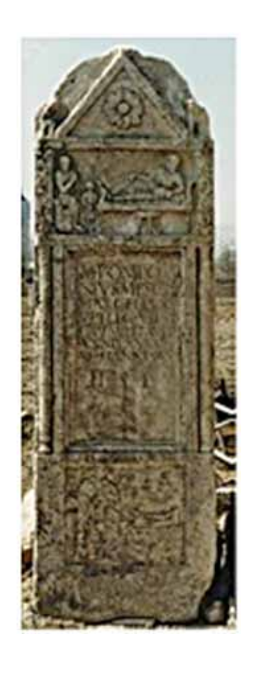
Stalae No.13 Bardovci