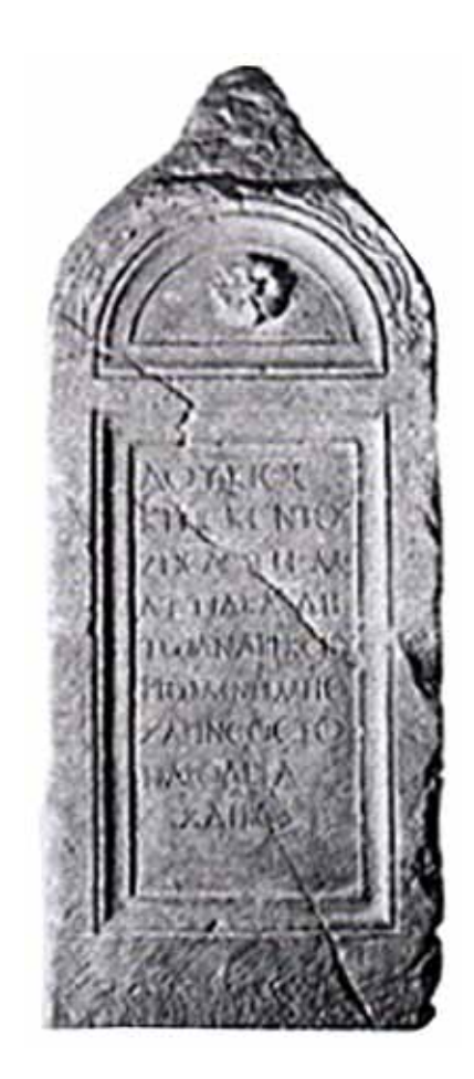
Stalae No. 8 Dolno Vodno