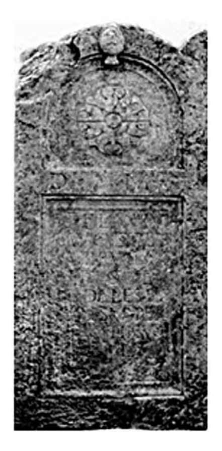
Stalae No. 6 Lopate