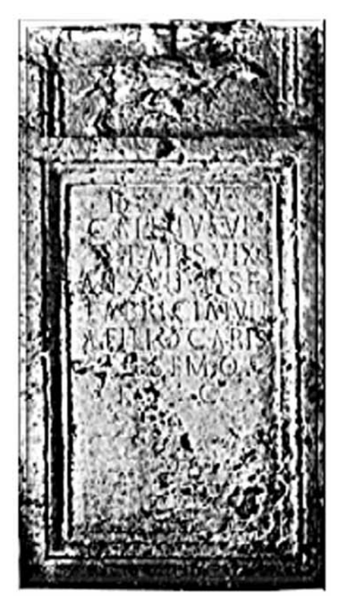
Stalae No. 5 Sredno Konjare