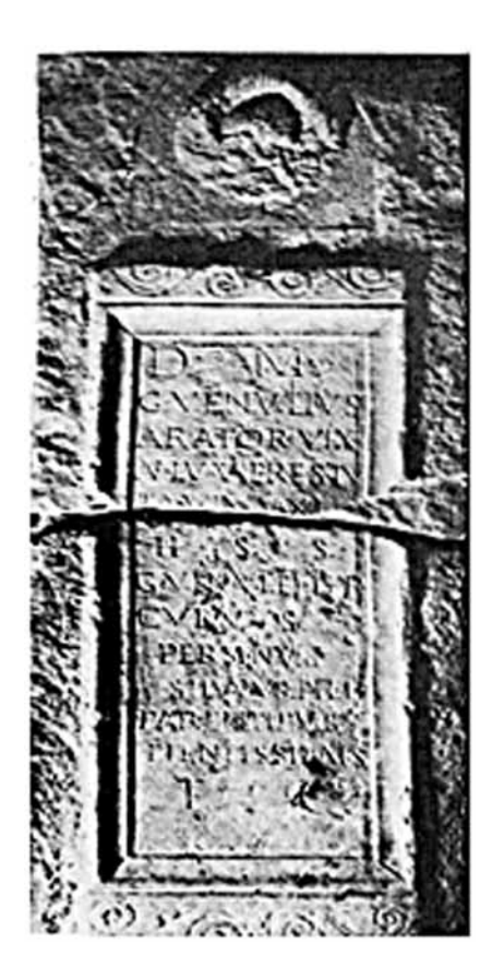
Stalae No.10 Sopishte