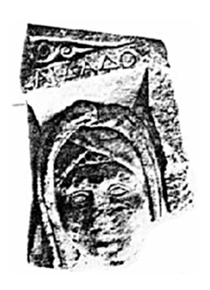
Stalae No.14 SI Macedonia