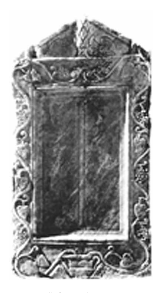
Stalae No. 3 Lopate