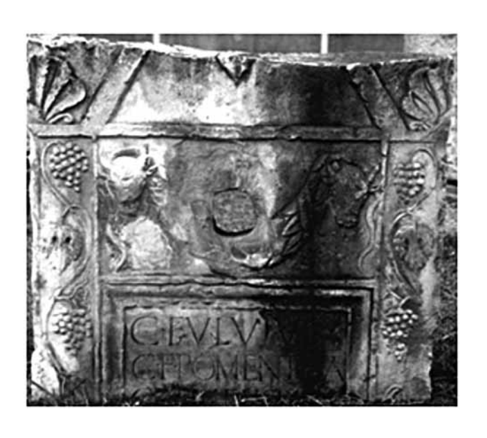
Stalae No.12 Skupi