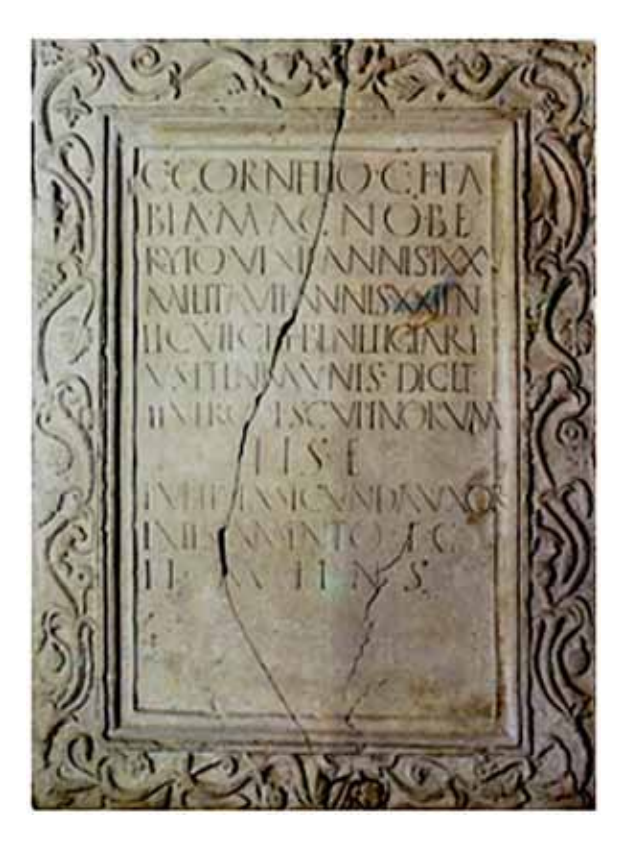
Stalae No. 2 Zlokukani