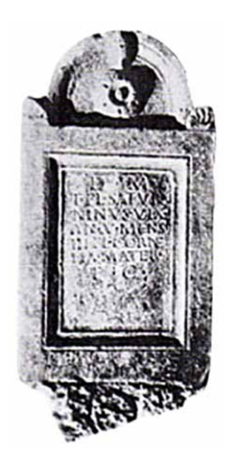
Stalae No.11 Vlae