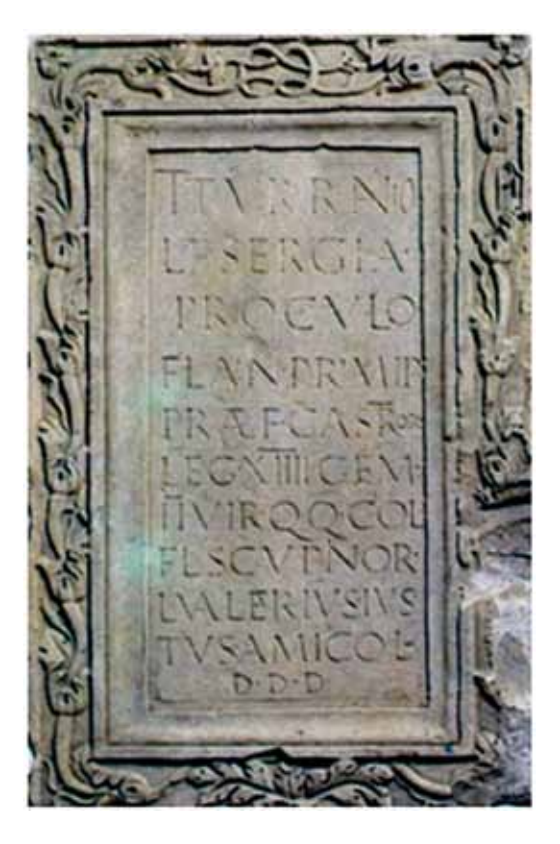
Stalae No. 1 Zlokukani