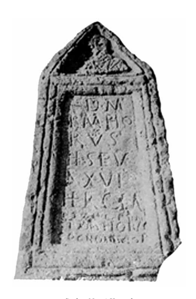
Stalae No. 4 Konjuh