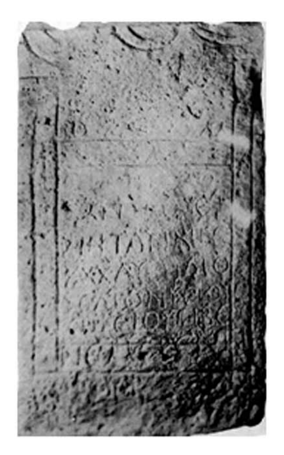
Stalae No. 9 Sredno Konjare