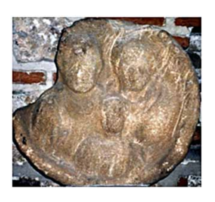
Medallion No.2 Gevgelija - Dojran